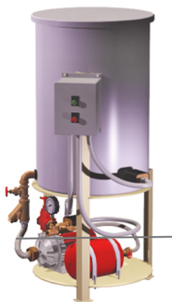
complex, expensive chemical feed systems